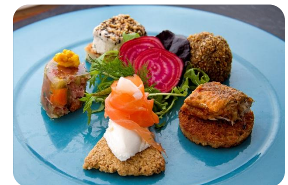
Scottish Tapas, Amber's signature dish...

354 Castlehill, The Royal Mile, Edinburgh EH1 2NE www.amber-restaurant.co.uk / 0131 477 8477